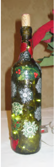
Lamp made from a bottle at a Franki's Fund activity.